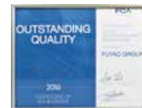
Chrysler Outstanding Quality Performance 2016