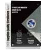
GM Supplier Quality Excellence Award 2016