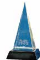
Ford Global Excellence 2015